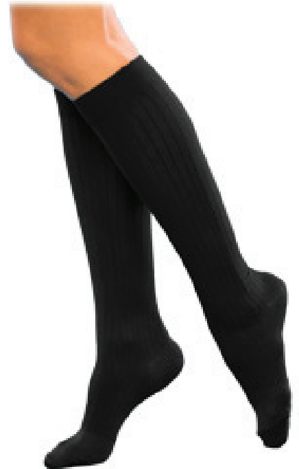
Women's Compression-Dress Sock

Having a healthy diet will help you keep a normal weight thus lowering leg symptoms and swelling.